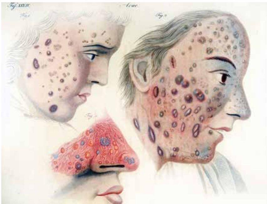
Acne rosacea illustration (Thomas Bateman, 1830) 5