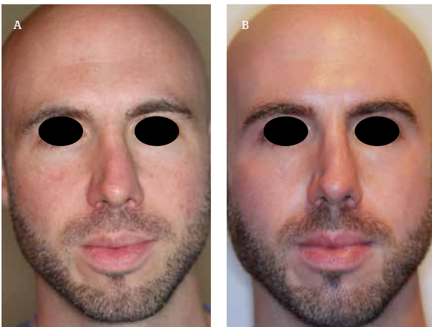
Figure 3 32-year-old male with rosacea treated for 18 weeks with ZO Medical (ZO ® Skin Health, Irvine, CA) and oral isotretinoin (20 mg daily). (A) Before and (B) after treatment

The benefits of Vitamin A in treating and maintaining rosacea are countless 3,16,17,26 . These include: barrier function restoration, epidermal thickening, increased tolerance, exfoliation regulation with more gelatinous stratum corneum, decrease in acneiform eruptions, evening of pigmentation, enhanced vasculogenesis, ageing suppression, improved moisturisation, pore size reduction, and collagen/elastin/NMF/GAG up-regulation. During the treatment phase of rosacea, retinoic acid should be used. For product and penetration enhancement, this is combined with Melamix ™ , and applied for three keratinocyte maturation cycles (18 weeks). After this period, the therapeutic properties of retinoic acid are exhausted, and chronic inflammation instead dominates. To avoid such irritation, retinoic acid should be replaced with a high dose retinol product (Radical Night Repair ™ or Retamax ™ , both 1% retinol) after 18 weeks. This will maintain the results achieved, and circumvent unwanted product-generated inflammation. Bearing in mind that rosacea is a chronic condition, should it re-present during maintenance, the patient can resume use of the retinoic acid/Melamix ™