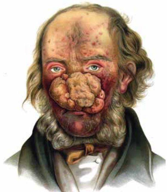
Acne rosacea illustration (Ferdinand von Hebra, 1869) 5

the disease. A blue or purple tint was given to bumps and pimples, while telangiectasia was portrayed as cracks in the skin 5 . Furthermore, because no treatment options were available at that time, the depicted faces were sorrowful, among advanced and alarming disease.